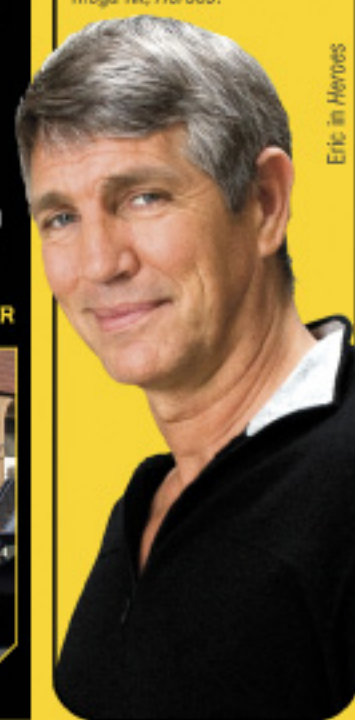
Eric in Heroes