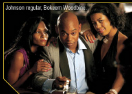
Johnson regular, Bokeem Woodbine.

In 1996, Roberts became the fifth actor to portray the Master when he starred opposite Paul McGann in the movie version of Doctor Who . Eric has since gone on to appear in current TV mega-hit, Heroes .