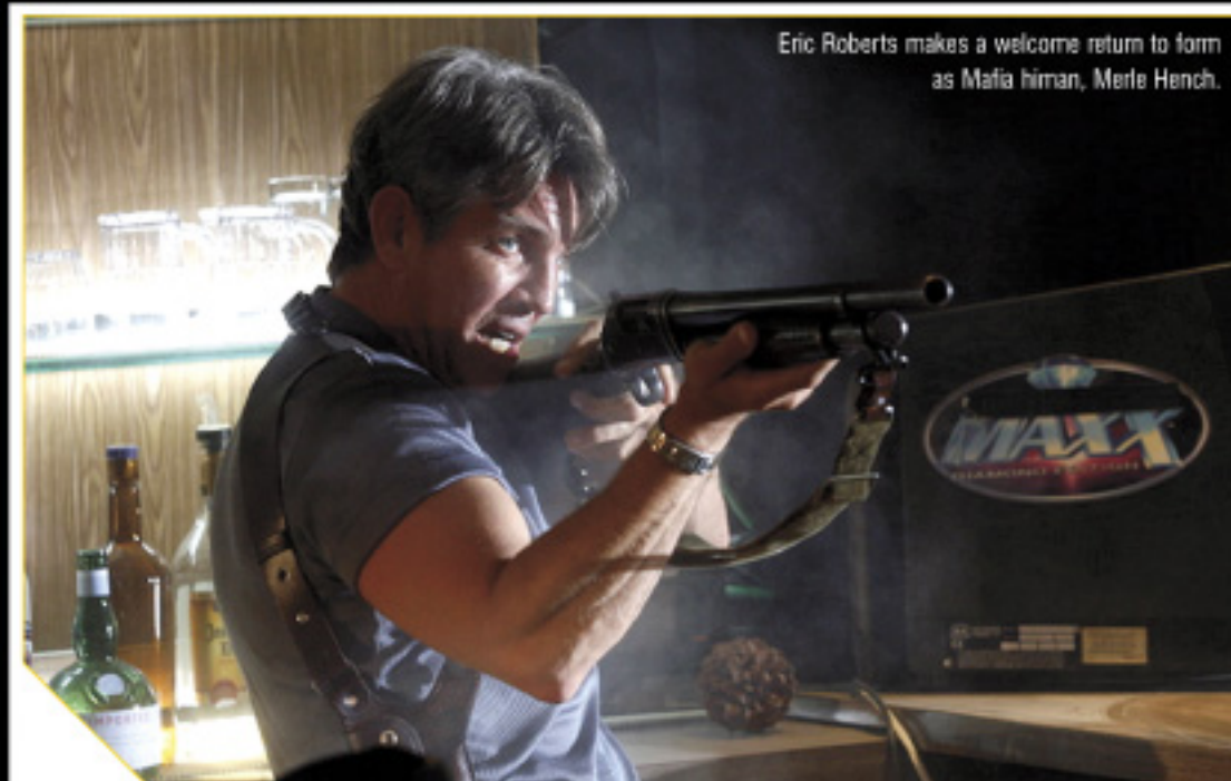
Eric Roberts makes a welcome return to form as Mafia hitman, Merle Hench.